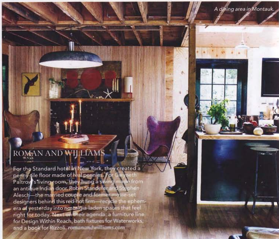
A dining area in Montauk.