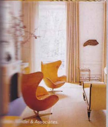
Winkel & Associates.